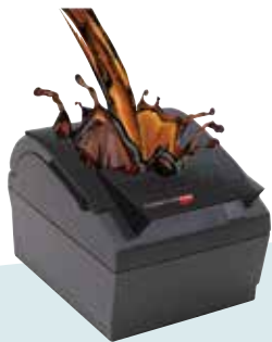
Spill Guard Option

CognitiveTPG's patented ReceiptWare marketing software transforms every receipt into a promotional opportunity. Add logos and watermarks, offer promotions, highlight sales and savings, run contests, promote your Facebook page, include your own QR Code...the options are endless!