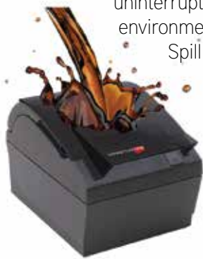
A798 with Spill Guard Accessory

The A798 was designed to withstand conditions in normal retail and hospitality environments where damage can occur. Designed with a liquid dam and unique drainage features, the A798 offers uninterrupted printing. For harsher environments, we also offer an optional Spill Guard accessory.