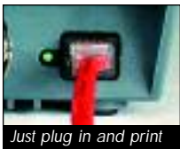
Just plug in and print

Innovative Cognitive printers lead the pack with network and mobile network ready e+Solutions. For varying size network installations, where footprint and price are key factors, e+ Solutions offer the most comprehensive internal Ethernet ports in the industry. For applications from warehouses to hospitals, e+Solutions make network printing fast and easy.